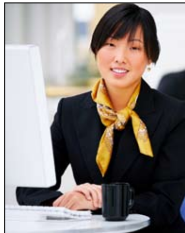
Sage Timberline Office Version 9.5 includes tools to help you stay on top of your projects.

set up users with a combination of operator and administrative rights. As well as the additional administrative rights, this gives the Power Operator role the ability to manage the lists of other operators. Administrators have the ability to set the Power Operator conditions, while still managing document and task security.